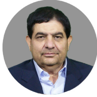
Dr. Mohammad Mokhber