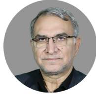
Dr. Bahram Einollahi

Minister of Health and Medical Education