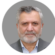
Dr. Seyed Solat Mortazavi

Minister of Health and Medical Education