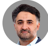
Dr. Rouhollah Dehqani Firouzabadi

Minister of Industry Mining and Commerce